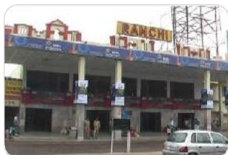
Ranchi Railway Station