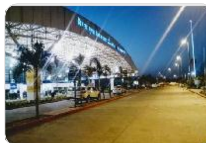
Birsa Munda Airport, Ranchi