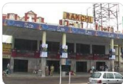
Ranchi Railway Station