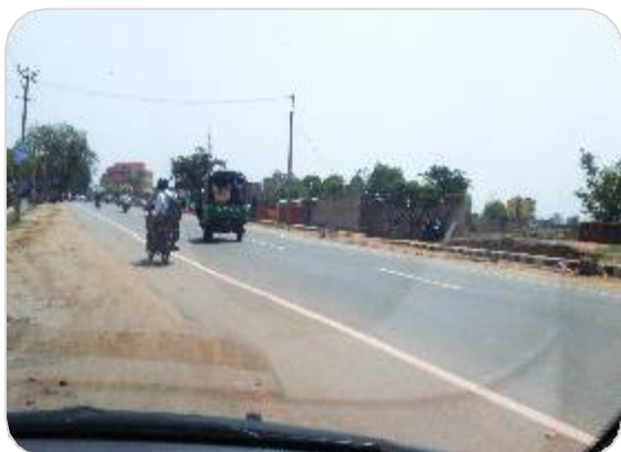
Roads in Ormanjhi