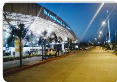
Birsa Munda Airport, Ranchi